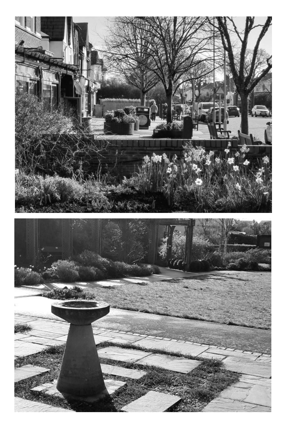
Praise to the Lord! The Almighty! The King of creation!